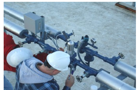
SMOOTHING RG WITH A BRUSH