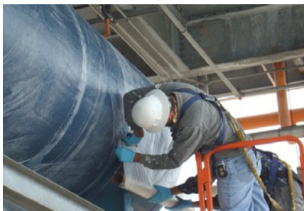
APPLYING MESH CLOTH