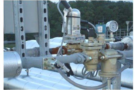
TYPICAL VALVE GROUP