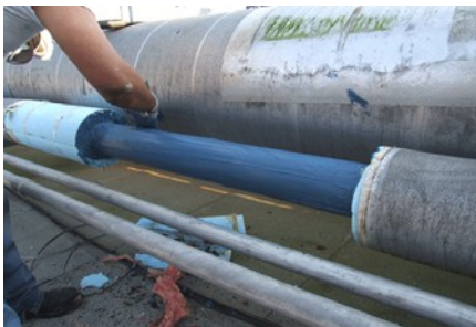
APPLYING RG-2400 (GLOVE)