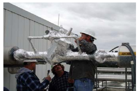
RG CAN BE PROTECTED FROM WEATHER