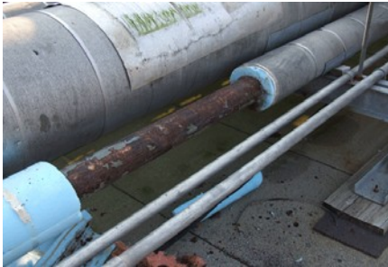
PIPE AFTER CLEANING

(this pipe required only removing loose primer)