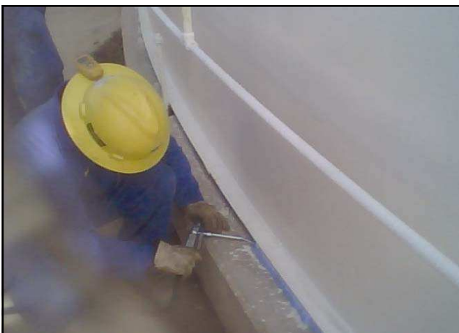
INSTALL RG-2400 AK IN CREVICE AREAS

The concept is a simple one; stop corrosion in the crevice environment where a metal vessel or tank comes into contact with a solid substrate or base. The product installation may vary as may the weather barrier over the