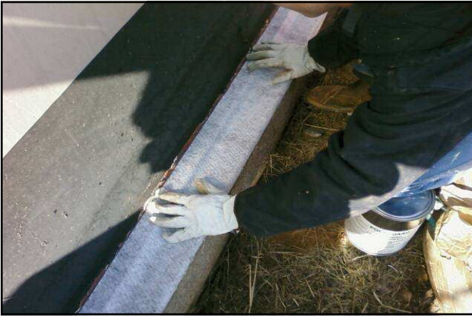
INSTALL SELECTED MEMBRANE