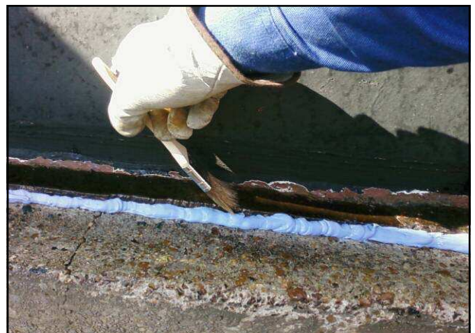
APPLY PRIMER TO CONCRETE AND METAL

P.O. Box 755 Ennis, TX 75120 PH: (214) 515-5000 FX: (972) 875-9425