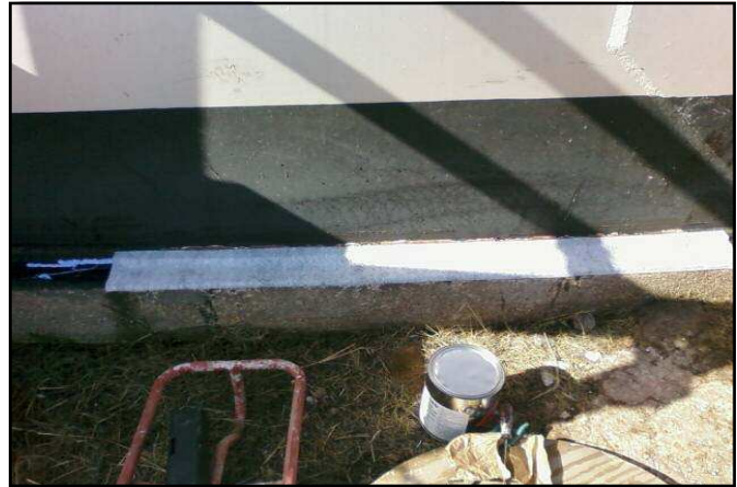
VISUAL OF FINISHED PRODUCT

installation. The process is very basic; clean the area to be treated as best as is possible (power wash, hand or power tools), dry the area (via time or temperature), inject the gel into all crevice areas, prime the metal and concrete surface and install a weather barrier for protection.